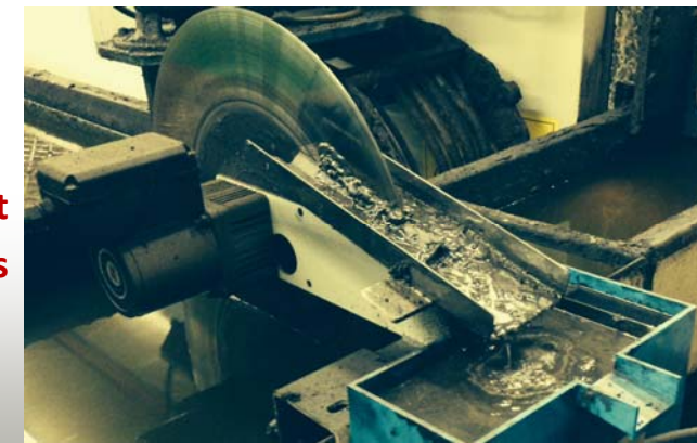
SS-60 Stainless Steel Oil Skimmer

Heavy duty construction and built to last in extreme machine tool environments