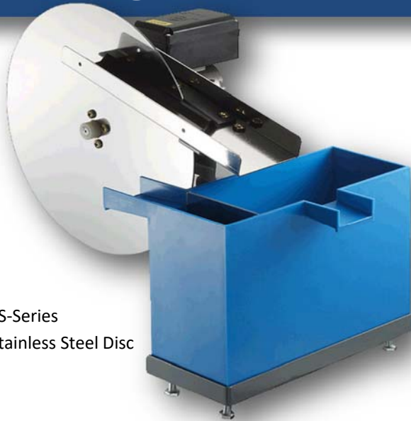
SS-Series Stainless Steel Disc