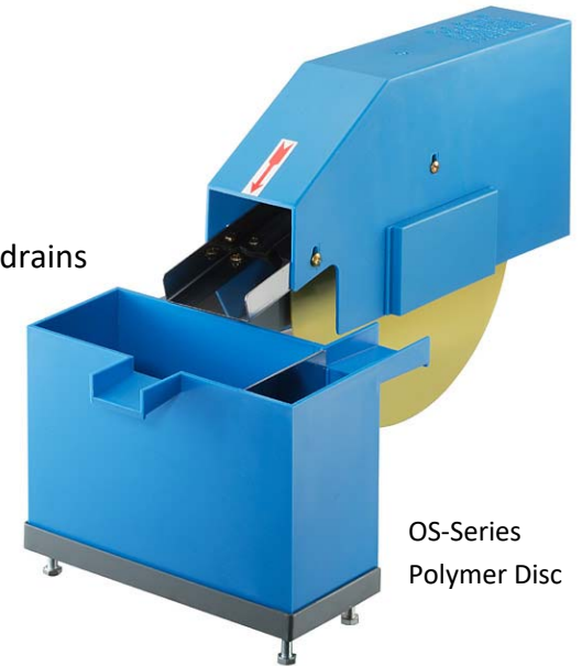
OS-Series Polymer Disc